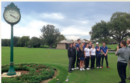
The team being interviewed at Bay Hill

With an annual budget of £250,000/$375,000 for coaching, travel, scholarships and equipment we rely on the support of donors to achieve our aims. There are a range of giving options available to help support the Saints Golf Donor Fund.