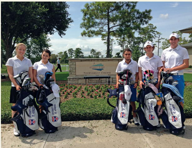
Team members at Redstone GC, supporter trip to Texas