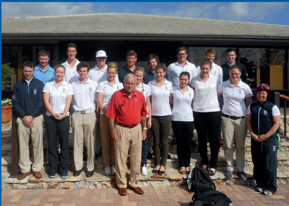
Warm-weather training at Bay Hill with Arnold Palmer